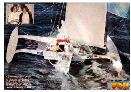
VSD – the trimaran