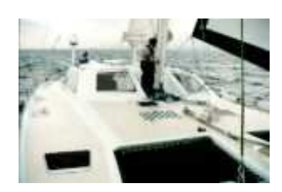
Brigand – Space 55. "Brigand has been almost perfect"

Brigand – Space 55. This is an example of what can be achieved by the skilled owner builder. A quality of finish and decoration that any professional would be proud of. For 5 or 6 years she was making two Trans Atlantic crossings each year - to charter in W. Indies and in Europe. KSS Space-56 wins ARC2007 in 9 days, 13.5 hours from Canaries to W. Indies. "Sailing beautifully, surfing at 23, 24, 25 kts".